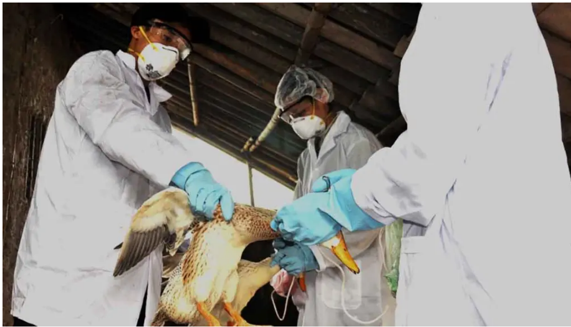
A duck receives a vaccination as part of USAID's efforts to combat bird flu in Vietnam.

According to the World Health Organization, seasonal influenza viruses spread throughout the world in a year or two, infecting 10 to 25 percent of the world's population and causing some 290,000 to 650,000 deaths . With a world population of about 8 billion, the fatality rate is between 0.0036 percent to 0.0081 percent. No wonder seasonal influenza does not seem particularly dangerous to many of us. It is likely that none of us or our close acquaintances will die. On the other hand, if the influenza virus were instead lab-created, somehow released outside the lab into the community, spread worldwide, and caused 290,000 to 650,000 deaths, we would be outraged that some lab caused these deaths.